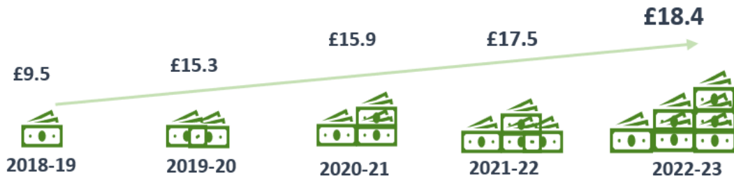
Comparison in millions